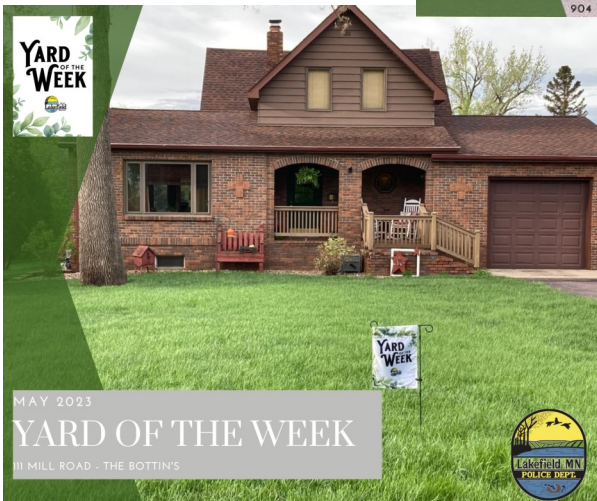
MAY 2023 YARD OF THE WEEK 11 MILL ROAD - THE BOTTIN'S