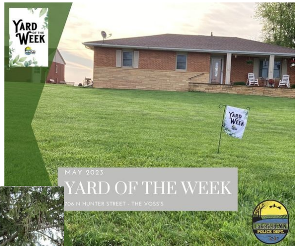
MAY 2023 YARD OF THE WEEK 706 N HUNTER STREET - THE VOSS'S